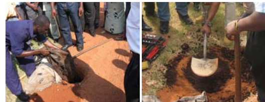
Fig 2: Application demonstration of PKOC on the field

To determine the effectiveness of the earth resistance reduction technique, the 1-m electrode was driven into a soil of resistivity 300 ohm-m. At this resistivity, earth resistance of 236-ohms was measured. The soil within the critical resistance radius of the 1-m electrode (0.4-m) was removed and backfilled with PKOC of resistivity 5.7 ohm-m.