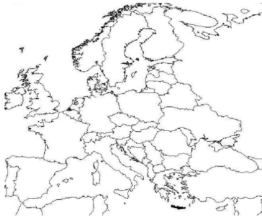
Fig. 1 A map of Europe with the island of Crete shown in black

Crete is a Greek island located in the Mediterranean basin, as shown in Figure 1. It has a rather elongated shape and its coastline exceeds 1000 km in length.