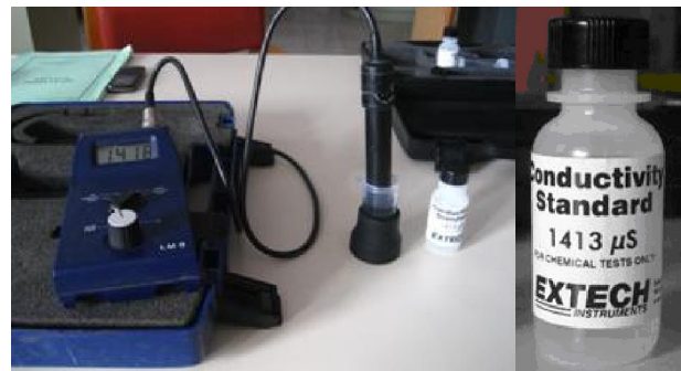
Fig. 5 Calibration and accuracy verification using a solution of standard conductivity

Solutions of standard conductivity were employed in order to verify the measurements and to calibrate the conductivity meter, as shown in Figure 5. Measurements were recorded on site as shown in Figure 6.