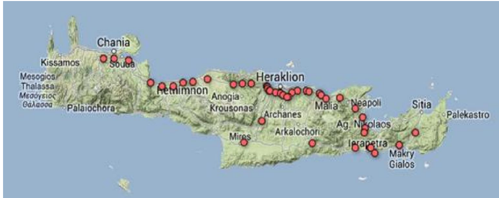
Fig. 3 The towers where ESDD measurements were conducted

For the selection of towers, past experience from the operation of the network, environmental conditions as well as location issues were considered. Therefore, more measurements were conducted on the north and east part of the island and especially around the city of Heraklion, where a combination of severe marine and industrial pollution is recorded [9].