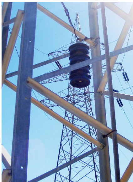
Fig. 4 A string of insulators (fog profile-porcelain) hanged (offline) from the metal structure of a 150 kV tower

Strings of insulators were hanged (offline) from the metal structure of 150 kV Transmission towers as shown in Figure 4. They were placed in a slightly lower height compared to live insulators, in order to be easily and safely reached by the crew. Porcelain insulators were selected due to their superior endurance, as the measuring period should exceed at least one year. Cap and pin insulators of both disc and fog profile were placed as both profiles are used in the island's transmission lines.