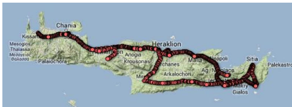
Fig. 2 The 150 kV transmission towers in Crete

The power network followed the island's development, and thus most substations and transmission lines are placed near the coast [4-12]. The position of all 150 kV Transmission towers (and thus, also the route of 150 kV transmission lines) is shown in Figure 2. The selected towers where ESDD measurements were conducted are shown in Figure 3 (figures created using Google Fusion Tables).