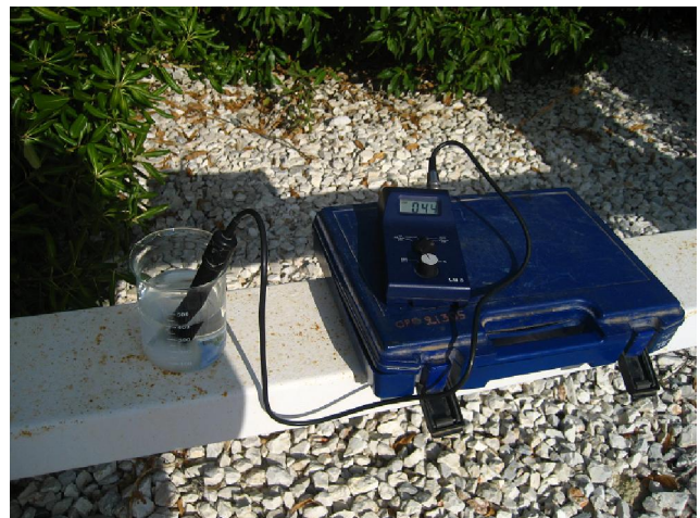
Fig. 6 Measuring ESDD on site

Considering the above mentioned dry period, measurements were conducted once a year, towards