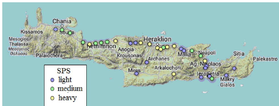
Fig. 7 Site Pollution Severity using the limits proposed by IEEE

Further investigation may optimize the results. For example, an important issue is the calculation of the area of the insulators' surface, which is used to calculate the final ESDD value in mg/cm 2 . Several methods can be employed to calculate this value. In this paper, the area values were taken from the corporation's archives and they were calculated when the insulators were first purchased by dividing the insulator's area in minor parts. However, a new calculation of the insulators' area using computer aided design tools may improve the accuracy. Further, it should be noted that the measurements were conducted on both disc and fog cap and pin insulators. According to [17] a correction factor should be employed to correlate such measurements. However, the value of this factor has not been fully determined. Therefore, comparable ESDD measurements should be conducted on insulators of different profile, placed in the same location. For this purpose, suitable arrangements were recently made in TALOS High Voltage Test Station and concluding results are expected in 2015.